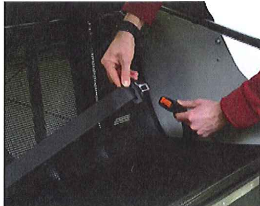
Passenger Seat Belt

"It is a bloody work of art, this marvel of yours... I've had countless comments from drivers and even bystanders. The cycle is rock solid. Its integrity is something to behold. Everyone is impressed... It looks like nothing else on the street here in NYC. The seating capacity is awesome. The frame seems indestructible-and the color is striking, too."