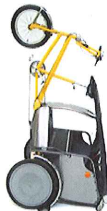
Pedicab parked vertically with folded hood